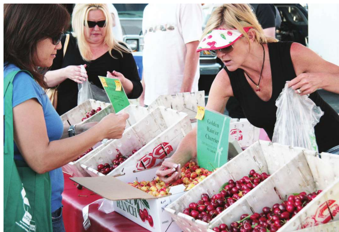
West Sacramento's Farmers Market, Opening Day

What knits together a community? Shared places, shared experiences, shared information. A soccer mom from Southport feels something in common with a grandpa in Bryte the day they both reach for the fresh cherries at the West Sacramento Farmers Market or check out the city's newest restaurant. They also become part of the same community when they have a chance to read, see and hear the same news, features and human interest stories they find in their local media.