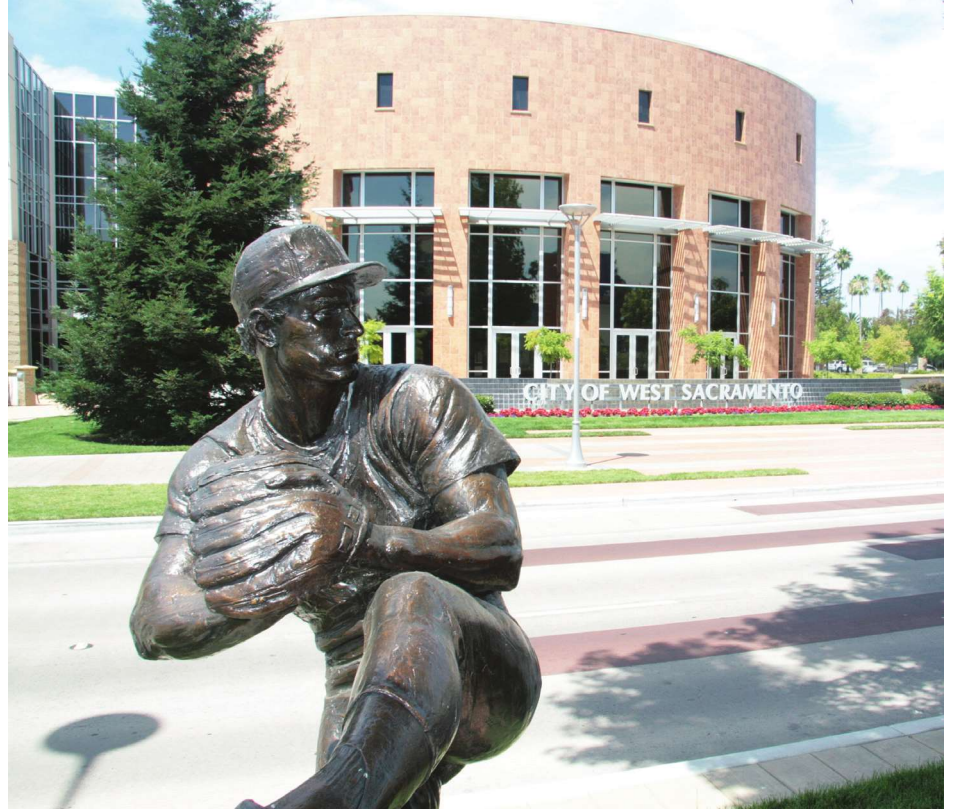
West Sacramento's "new" city hall

KYWS-LP is charged with shining the spotlight on West Sacramento by investigating news stories that need to be told: local crime & policing? the quality of West Sacramento schools? public pensions? If it's on KYWS-LP's turf, it's KYWS-LP's job to find out about it. Towards that goal, sometimes there's just no substitute for the skills and contacts of a professional journalist.