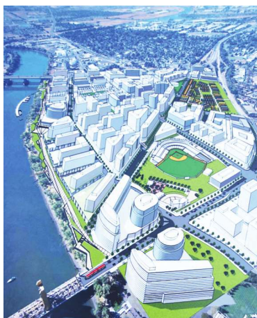
Growth & vitality: an architect’s rendering of West Sacramento viewed from the future ‘Bridge District’